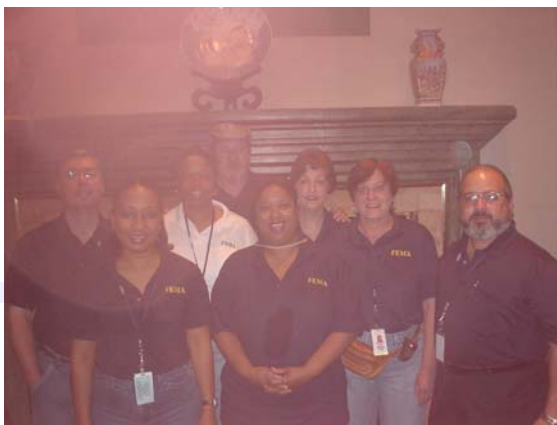
Pictured: Staff of CMS and FEMA who helped in the recovery efforts of the Florida Hurricanes this summer